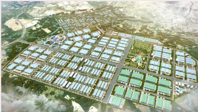
Gilimex Thua Thien Hue IP

Thua Thien Hue has significant investment attraction potential. The highlight is smart transportation and urban infrastructure, and functional zone infrastructure that create competitive advantages in attracting high-quality investment capital.