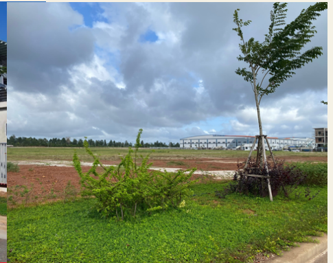
Gilimex Thua Thien Hue Industrial Park - Area A