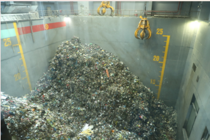
Phu Son Waste-to-Energy Plant, Hue

Selex Motor has become Vietnam's first electric vehicle company to pilot carbon credit sales, while VinaCapital's waste-to-energy plant project is also aiming to sell these credits. Vietnam currently has 72 projects registered, verified, and certified for carbon credit sales.