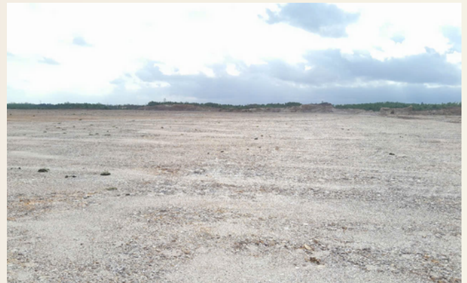
Gilimex Thua Thien Hue Industrial Park - Area B