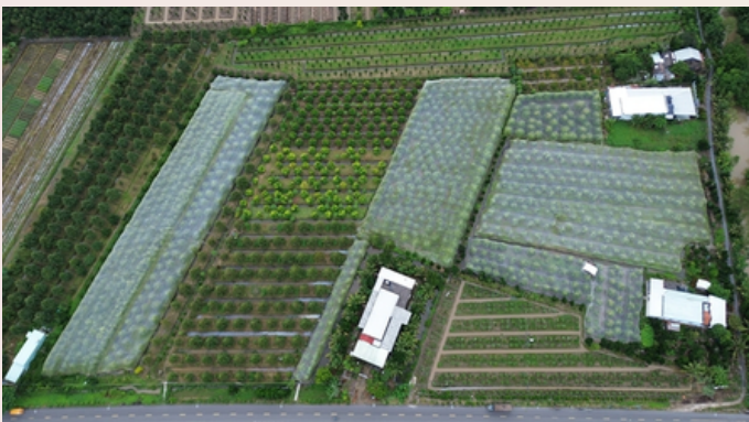
Agricultural production models adapt safe and high-tech practices in Binh Tan District, Vinh Long

After more than 15 years of implementing the new rural development program, Vinh Long has seen significant positive changes, with the quality of life improving for residents. Districts such as Binh Tan and Tam Binh have completed infrastructure projects, advanced high-tech agricultural development, and met the criteria for enhanced new rural standards.