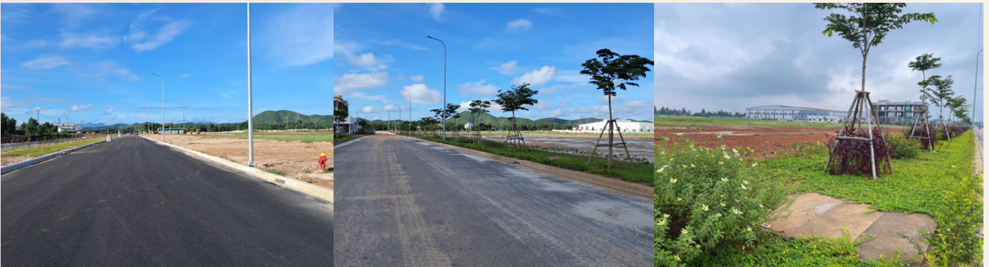
Images of Area A at Gilimex Thua Thien Hue Industrial Park