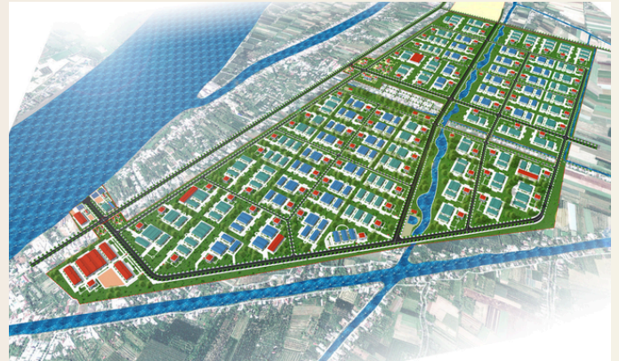
Gilimex Vinh Long IP