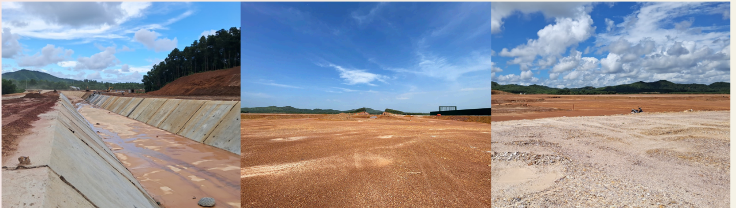
Gilimex Thua Thien Hue Industrial Park - Area B