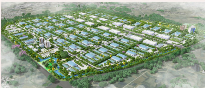
Gilimex's new project in Bac Giang

The industrial real estate market has witnessed a strong acceleration from domestic and foreign investors. In Bac Giang, Gilimex has just been granted IRC for Nghia Hung IP project of nearly 149 hectares, with a total investment of VND2,200 billion.