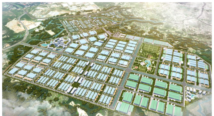
Gilimex Hue IP

The wastewater treatment plant has a total investment of over VND 130 billion, applying advanced technology with a designed capacity of 7,600 m 3 /day and night.