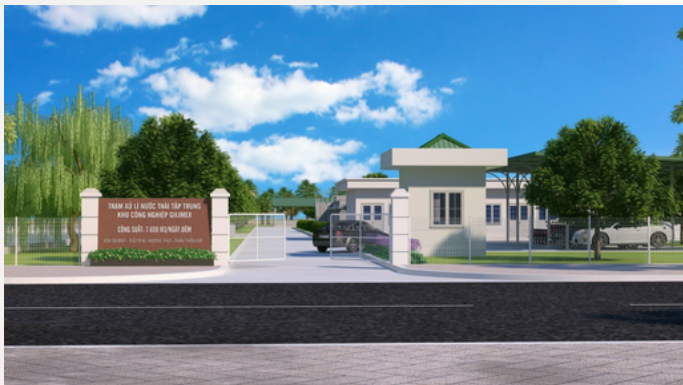
Gilimex Hue IP wastewater treatment plant project