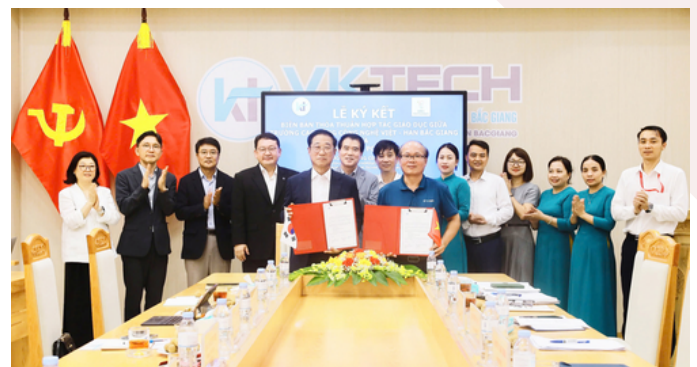
Vietnam - Korean College of Technology (Bac Giang) and Korean Polytechnics University (Republic of Korea) signs a cooperation program

With the goal of becoming one of the country's semiconductor and artificial intelligence (AI) industrial production centers by 2030, the province has offered many policies to attract high-quality human resources.