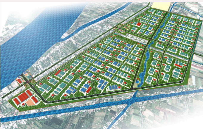
Gilimex Vinh Long IP project

Along with strategic transport infrastructure projects, the province promotes administrative reform, supports businesses and creates a transparent and favorable business environment to attract domestic and foreign investment.